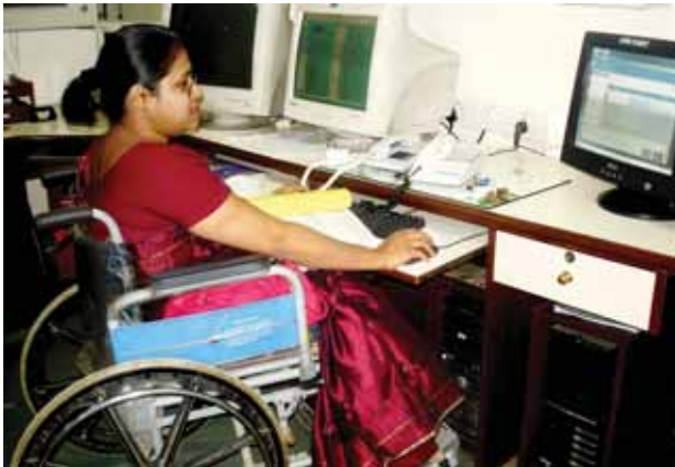
Lady with Mobility Impairment at Sheraton New Delhi

The odds are high that it will work out – research shows that people with disability perform well and have a high retention rate. However, if things don't work out, your normal procedure for dealing with performance problems applies.