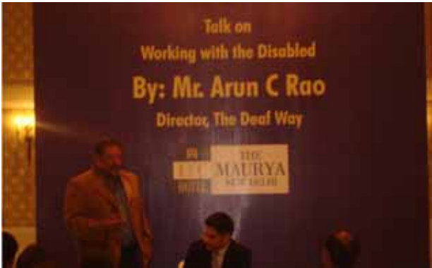
Theory coupled with live demonstrations created a lasting impression on the minds of Mauryans.