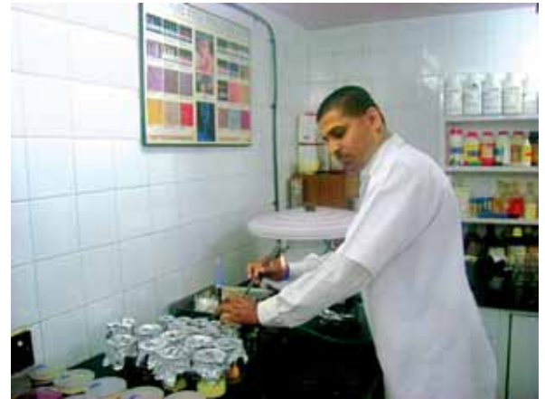
Gentleman with Speech Impairment at ITC Windsor, Bengaluru