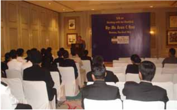
The one and a half hour session focused on clearing misconceptions and bringing awareness among the associates.