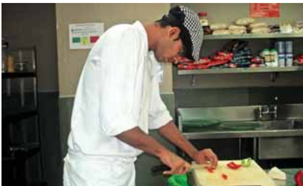
Gentleman with Sight & Speech Impairment at Sheraton New Delhi

Instead of comparing our lot with that of those who are more fortunate than we are, we should compare it with the lot of the great majority of our fellow men. It then appears that we are among the privileged.